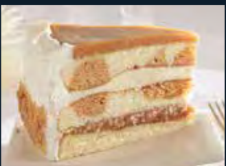
Salted Caramel Vanilla Crunch Cake