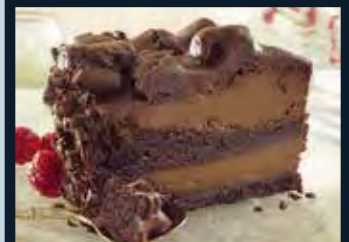
Choc'late Lovin' Spoon Cake

A lemonade inspiration, with layered lemon cake, a cool lemon mousseline and Meyer lemon curd 5.49