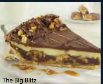
The Big Blitz