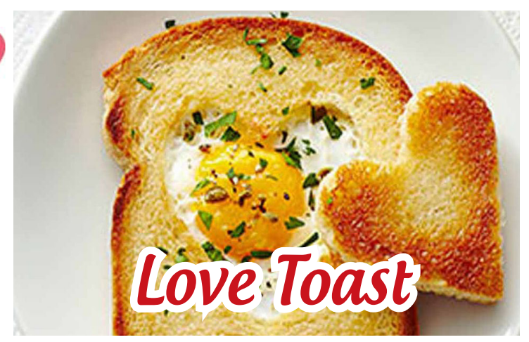
Even the manliest of men won't be able to resist this cute take on Egg-in-a-Hole.

ARROW FLOWERS MAILBOX CANDY GIFT PINK CARD HEART POEM CHOCOLATE HOLIDAY RED CUPID HUGS SWEETHEART FEBRUARY LOVE VALENTINE